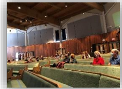
Preaching at Grandview, Kitchener, ON - first Sunday after "Lock-down"

Our Fellowship National office remains closed with restricted access. It looks like we'll continue these protocols for a few more months at least. Covid has definitely changed the way we work and communicate with one another. One of the new ways we've started keeping in touch with our Fellowship Chaplains across the country and our Fellowship International missionaries around the World is through weekly zoom prayer gatherings. I've never felt so connected with our 200+ missions' personnel.