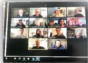
A weekly "Zoom" gathering with our missionaries