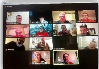
A "Zoom" gathering with our Fellowship Chaplains

I trust this edition of my President's Prayer Partner Newsletter finds you healthy and encouraged. This virus continues to make such an impact on our lives.